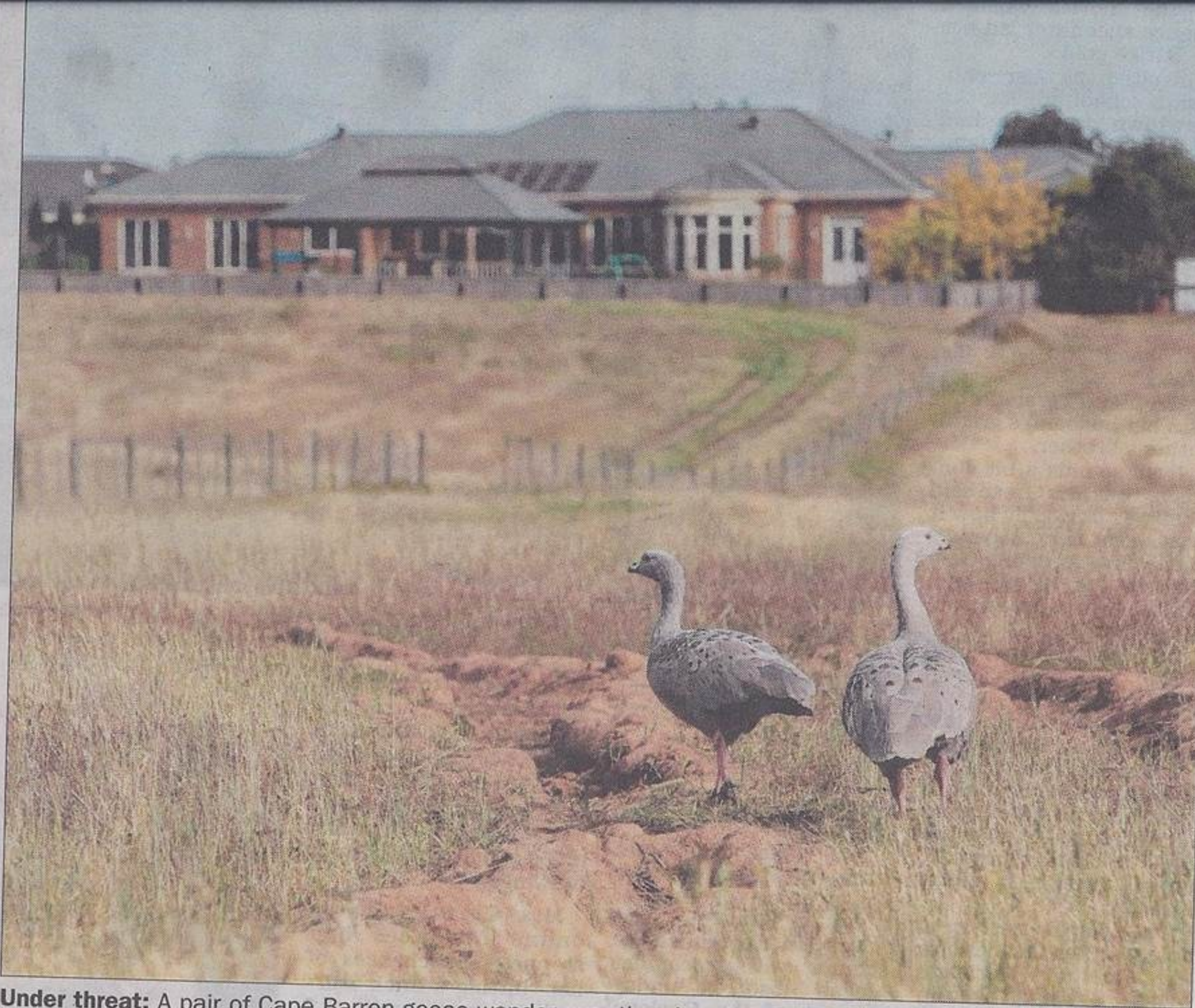
Under threat: A pair of Cape Barren geese wander over the site of the proposed 380-house development at Lara this week.

"Lara likes to be Lara. It doesn't want to be part of Corio. It doesn't want to be part of Werribee."