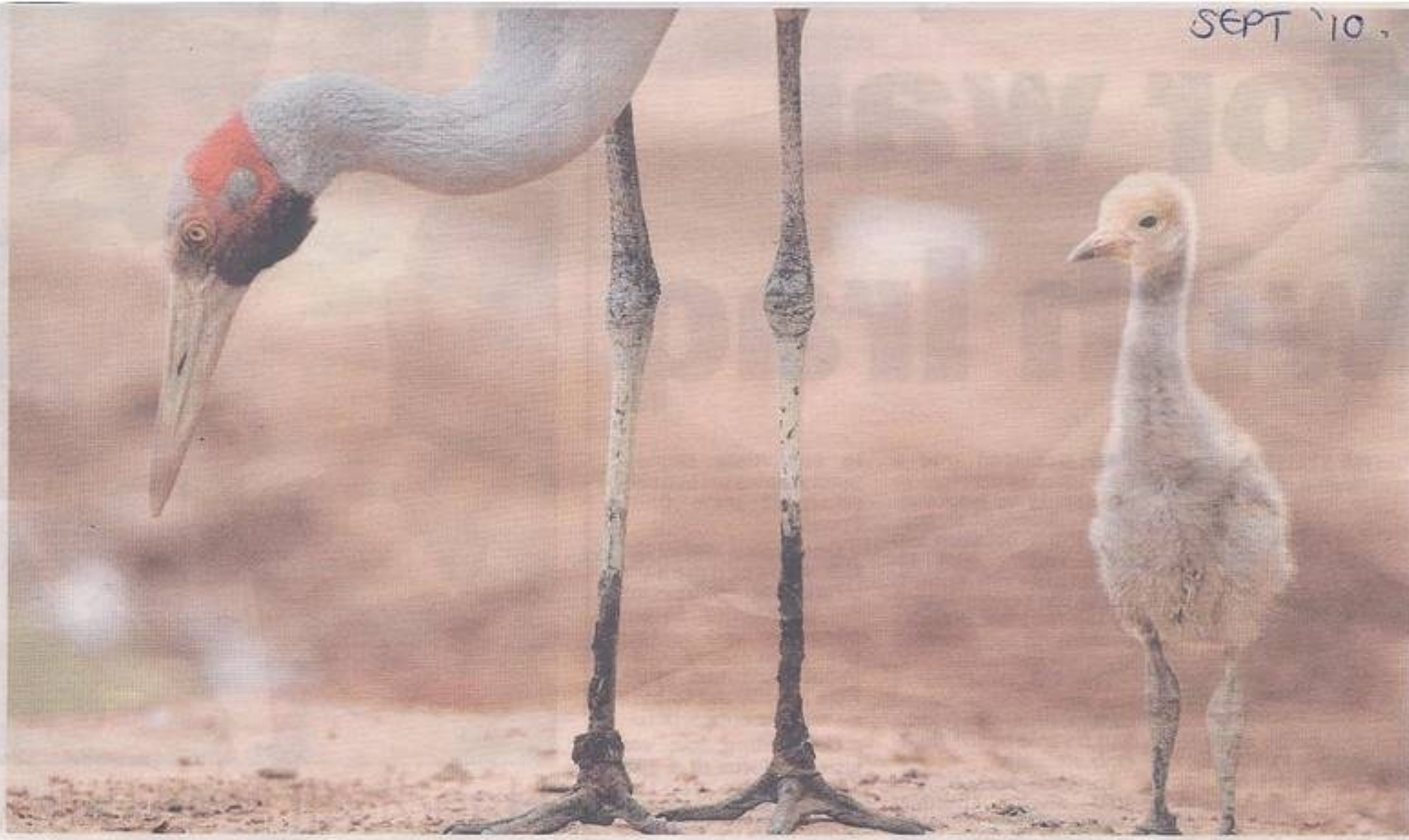
AT RISK: Serendip Sanctuary will be threatened if housing goes ahead nearby, claims reader.